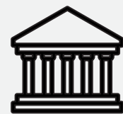
Consultants & Lawyers